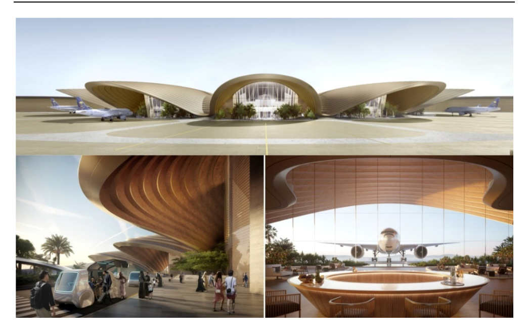
Fig. 4. The Red Sea Airport, by Foster + Partners, Hanak, Tabuk, Saudi Arabia (official representative of Foster + Partners Architects)

Norman Foster's studio aims for the airport to achieve a LEED Platinum sustainability rating. The airport will be run 100% from renewable energy sources, both during construction and in the future: zero-use of disposable plastic will be implemented during operation.