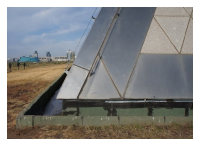
Fig. 2. Structural unit of the building's movements

The Pyramid's architecture uses innovative techniques that have placed it at the forefront of modern construction: British engineers used unique movable articulated structures at the base of the pyramid, capable of responding to seasonal temperature variations by contracting and uncompressing with an amplitude of 6 cm.