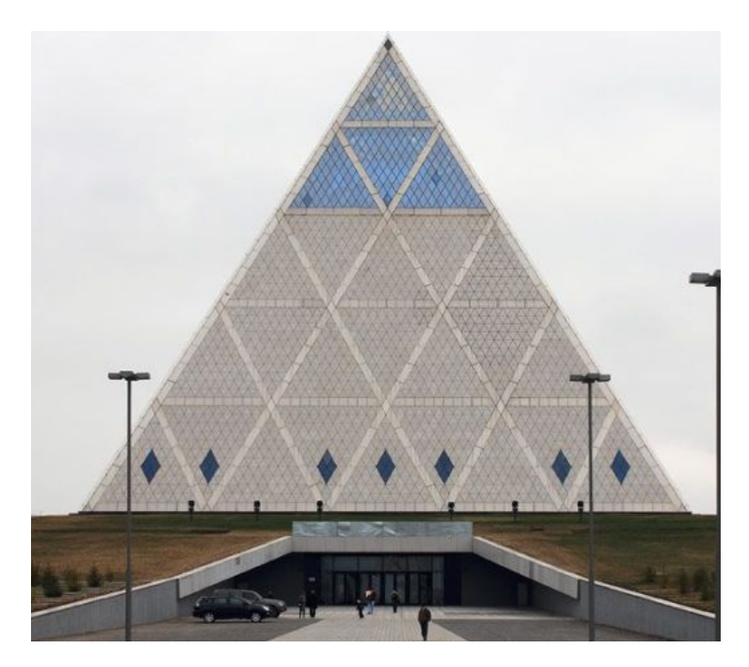
Fig. 1. Perspective of the Palace of Peace and Concord, Astana

"The Palace of Peace and Concord" is widely known by the unofficial name of "Foster's Pyramid". The artistic image of the building in the form of a pyramid reveals a regional picture of the world: the square base (61.8x61.8 metres) symbolises the earth, while the top of the pyramid represents heaven, eternity (Figs. 1 and 2). Compositionally, the structure expresses the idea of the centre of the universe and the unity of different religions.